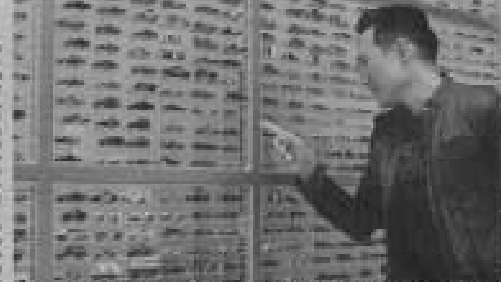
Hot Wheels brand of toy cars, including a 1966 white Chevy Chevelle, are featured in Mattel's new display at the company's showroom in Mumbai.

For an 80-year-old brand, Hot Wheels is still going strong. The company has managed to stay relevant in a market that is constantly changing.