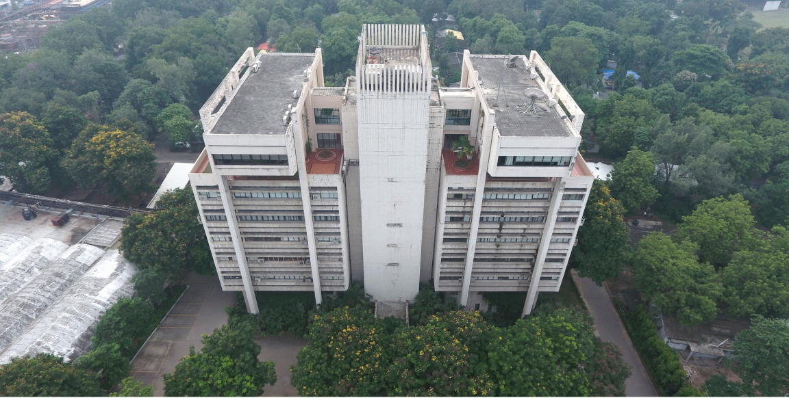
Administration Building, Alembic Limited, Alembic Road, Gorwa, Vadodara – 390 003